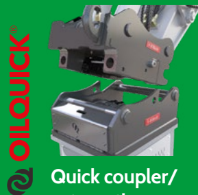
Quick coupler/ automation

«The valuable experiences of our customers from the rental park are continually taken in account in the development of our equipments.»